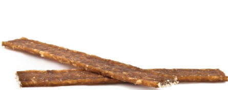
Deer rawhide strips

They're also low in calories and practically fat free.