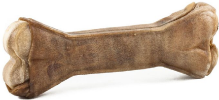
Deer rawhide chew bone