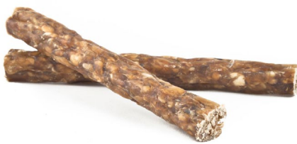
Deer rawhide chew stick