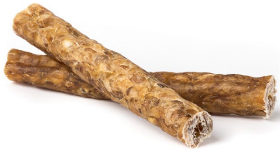
Horse rawhide chew stick