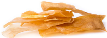
Horse rawhide chips

Because there is little likelihood of allergies, these chews make an excellent snack for dogs prone to food allergies and those with sensitive stomachs.