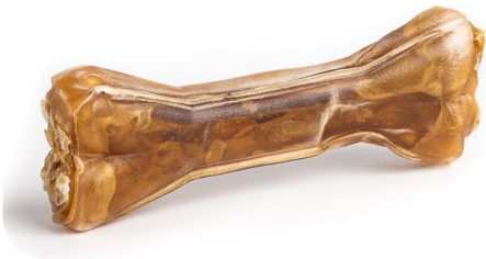
Horse rawhide chew bone